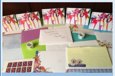
176 Notes Companions Journeying Together