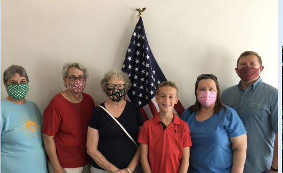
80 Meals Packed