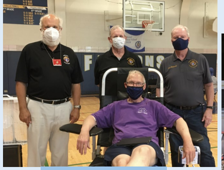
25 Blood Donors